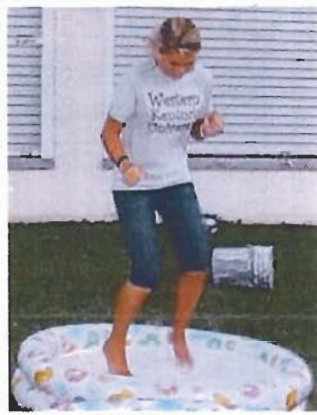
Walking on... non-Newtonian fluids!