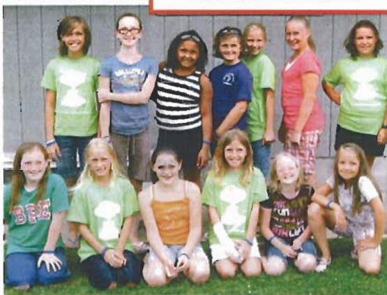
These girls are ready for some SCIENCE!