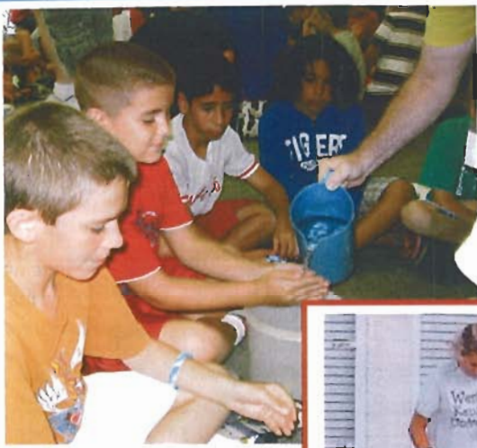
Washing up Tanzanian-style