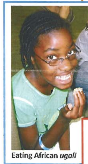
Eating African ugoli